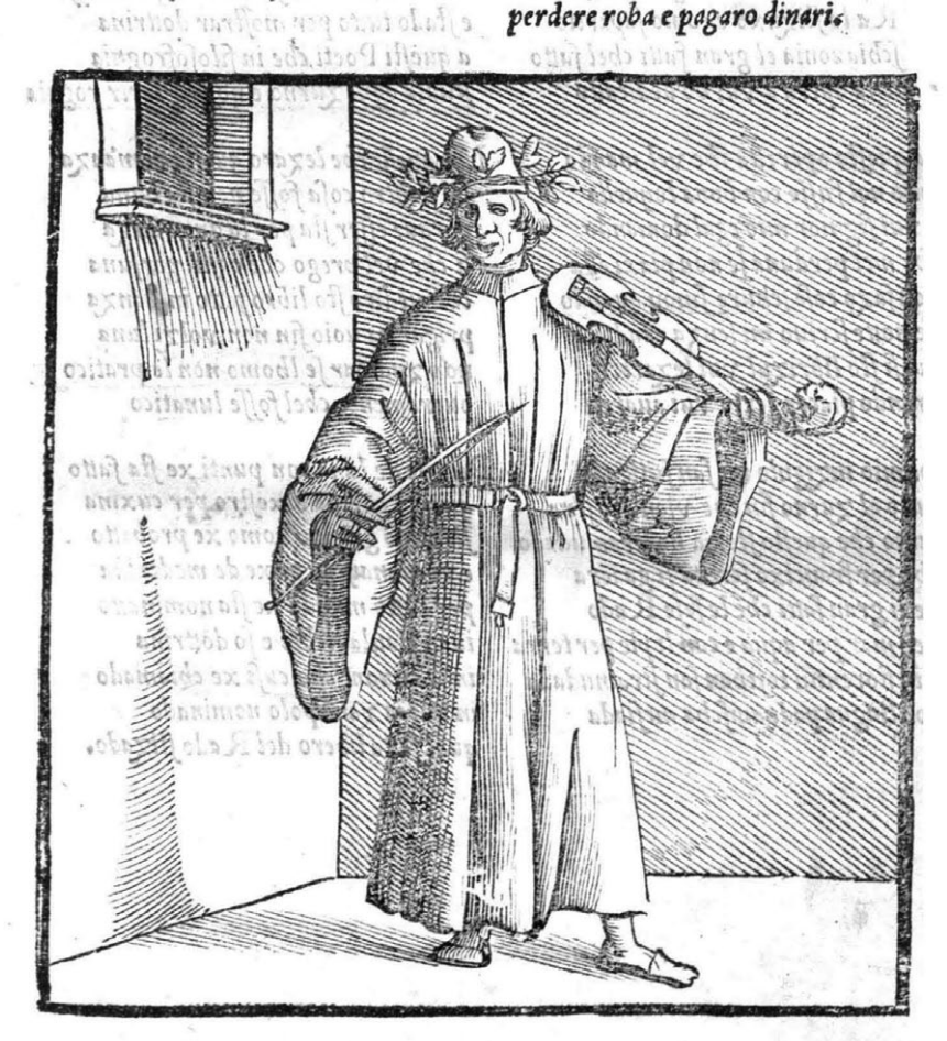
Fig. 2 Zuan Polo, 1533, woodcut (in Ioan Paulavichio (alias Giovanni Paolo Liompardi)], Libero del Rado stizuxo (Venice: Bernardino Vitali, 1533), frontispiece) [artwork in the public domain, photograph courtesy Ludwig-Maximilians-Universität München, Universitätsbibliothek, 0014/W 4 Techn. 128]

e questo xe vero per dio beneditto fi che mi ve lho ditto fignuri chari si ve le trouo perdere roba e pagaro dinari.