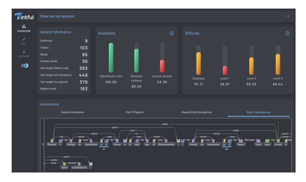
Fig. 3. A screenshot of the Tintful web interface.

The tool is written using the Stanford CoreNLP paradigm, therefore a third part software can be integrated easily into the pipeline.