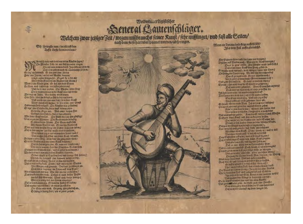
Fig. 2 – Combining text, image and musical allusions the broadside (n.p. 1631) satirizes the fictious "General Lautenschläger" by comparing his military activity with his unsuccessful performances as lute-player.

Intermedia cultural artifacts such as broadside ballads, simultaneously vocal and written media, employing also music and woodcuts, epitomize the dynamic process of media transfer and provide illuminating insights into early modern society, as shown by Jan-Friedrich Missfelder's contribution to this special issue<sup>38</sup>. Broadsides, moreover, were 'recycled' prod-