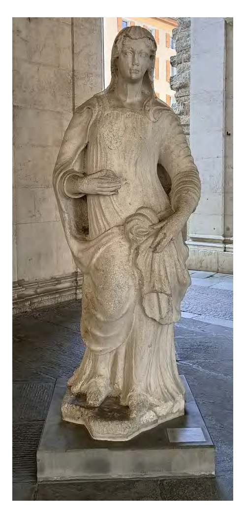
Fig. 5 – Unknown artist, Ludovica della Loggia. Botticino stone, Brescia, Piazza della Loggia, second half of the 16th century.

in Milan or the Ludovica in Brescia (Fig. 5) - <sup>50</sup> and they are quintessentially intermedia cultural objects, intersections of written, architectural, oral and visual forms of communication.