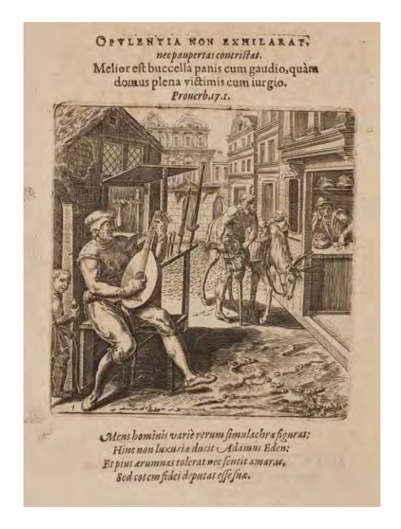
Fig. 4 – Theodorus Cornhertius, "Emblemata Moralia, Et Oeconomica, De Rervm Vsv Et Abvsv" (Arnheim, 1609). Street performer and a baker offering goods. The image connects with the moralizing texts on the top. Credits: Public Domain (http://diglib.hab.de/drucke/258-2-hist-2s/start.htm?image=00002).

These were blank albums designed to collect signatures, mottoes, coatsof-arms, portraits and visual imagery of acquaintances and encounters as students (but also merchants, artists, and humanists) moved between different places. «Albums were forms of social media that connected individuals to a network, sometimes of strangers», open to future members or readers, using a multimedia combination of languages with a strong interaction between handwritten and printed words and drawn and collected (printed or drawn) images<sup>43</sup>. Humanists' emblem books performed a similar function representing another example of the textual-visual interplay (Fig. 4).